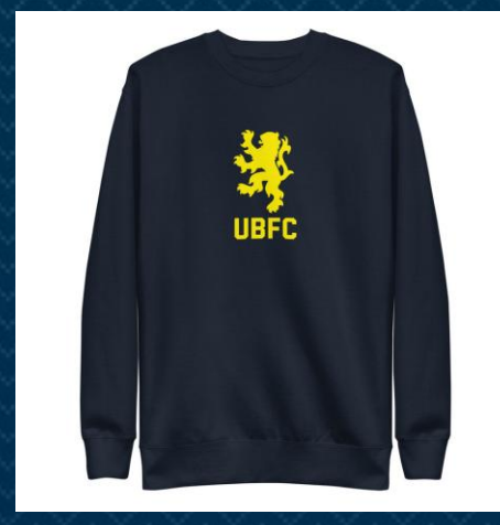
Emblem Yellow Sweatshirt £74.99