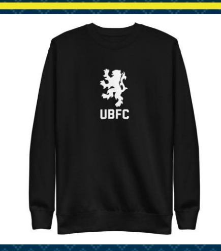
Emblem White Sweatshirt £24.99