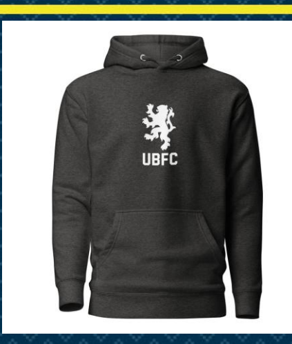
Emblem White Hoodie £28.99