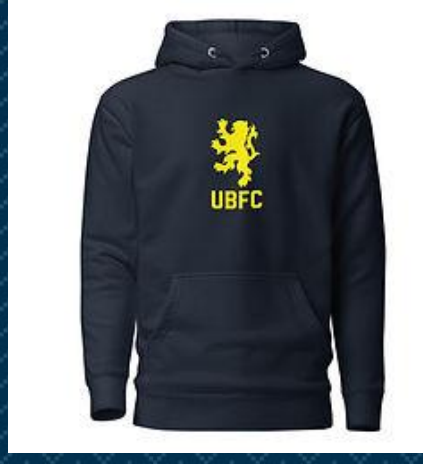
Emblem Yellow Hoodie EZ8.99