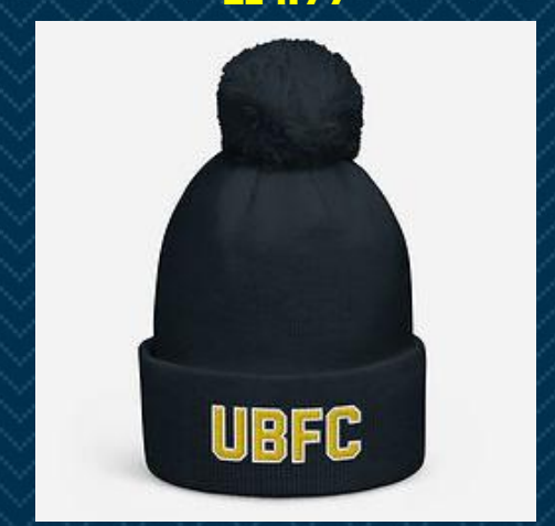
Pom-Pom Beanie £17.99