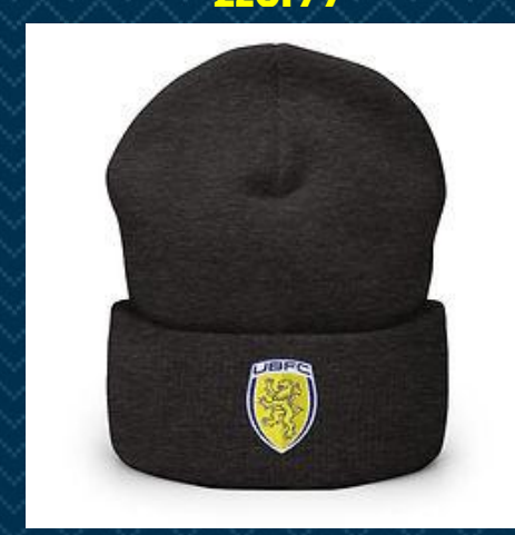
Cuffed Beanie £19.99