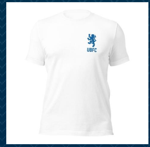
Emblem Blue t-shirt